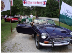
Write up stolen from Melinda Watson's Facebook page.