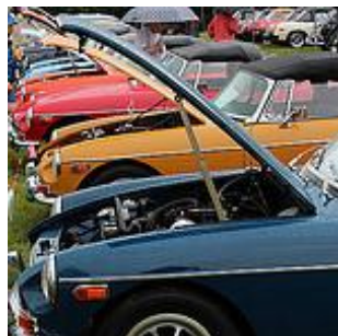
Some cars from the 2014 Springtime in the Smokies show

15-17 May is the Import & Kit Nationals at Carlisle, Pennsylvania. Know this is quite a few miles away, but if the price of gas stays nice and low it's definitely an interesting show.